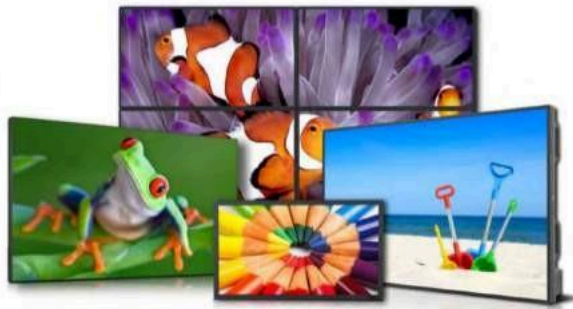
Monitor Sizes from 38" - 84"